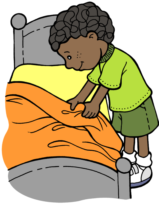
Making the bed