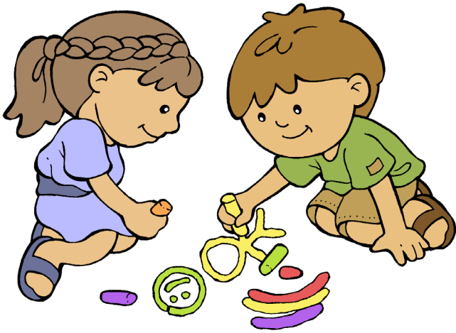
Drawing with a friend