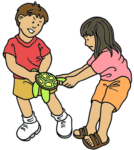
Fighting over a toy