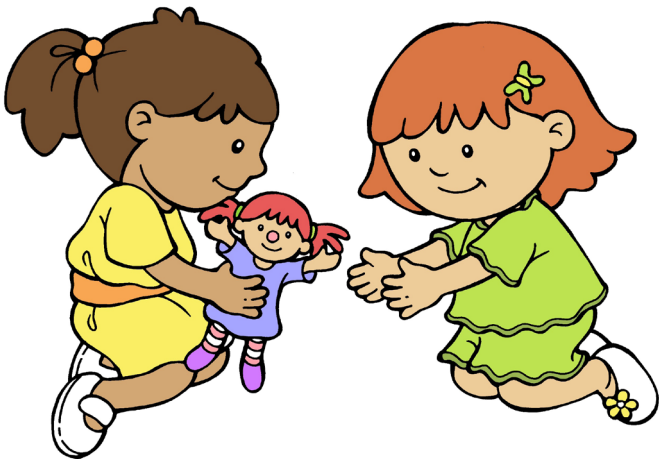
Sharing a toy