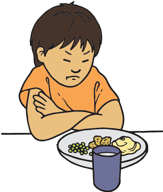
Not eating any dinner